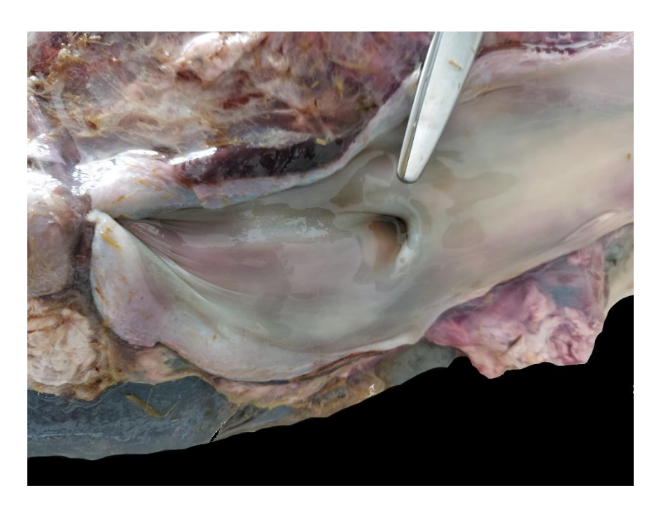
Figure 1 - Esophageal lumen presentation of bronchoesophageal fistula.

A necroscopic examination of the animal was performed, which presented a fistula in the middle third of the thoracic esophagus (Figure 1) with communication to the right lung lobe, forming in the cranial and middle portion of the lung parenchyma an encapsulated area measuring 24.5 cm x 22.0 cm x 9.4 cm filled with abundant rumen content (Figure 2A and 2B). The examined portion adhered to the parietal pleura, where it was possible to visualize the presence of fibrin. No other significant macroscopic findings were observed.